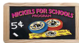
Kemps nickels for school