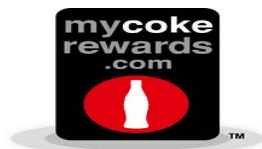
My Coke Rewards